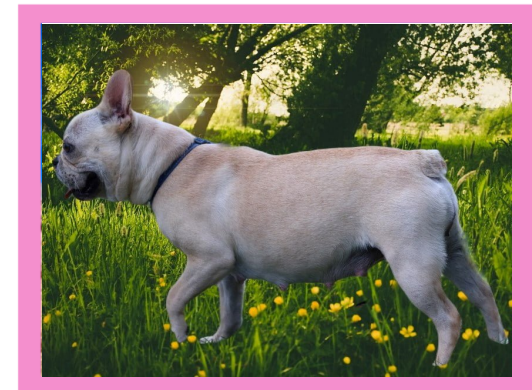
Willow (French Bulldog)