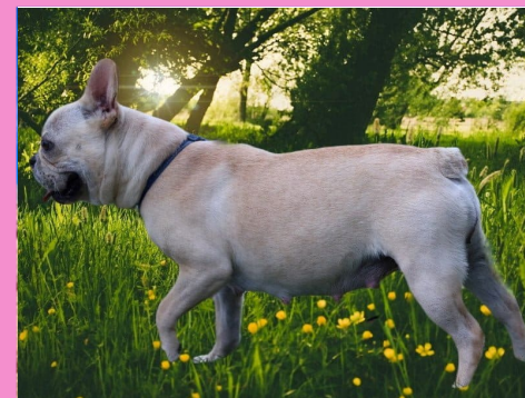
Willow (French Bulldog)