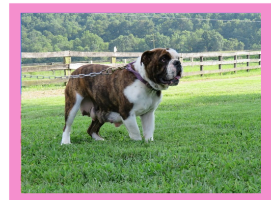
Beauty (English Bulldog)