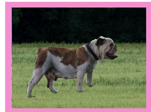
Keeper (English Bulldog)