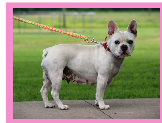
Billow (French Bulldog)